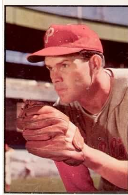
Figure 1: Image public domain.

To understand the mathematics behind this better, we shall enlist the help of Robin Roberts, legendary Phillies pitcher and the only Spartan inducted to the Baseball Hall of Fame.